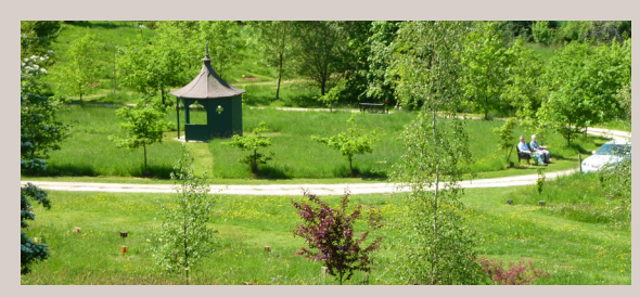
Westall Park Woodland Burial, Redditch, Worcestershire

We recommend choosing an ANBG member because, by agreeing to abide by the Code of Conduct, members are committed to ensuring the best possible service for families.